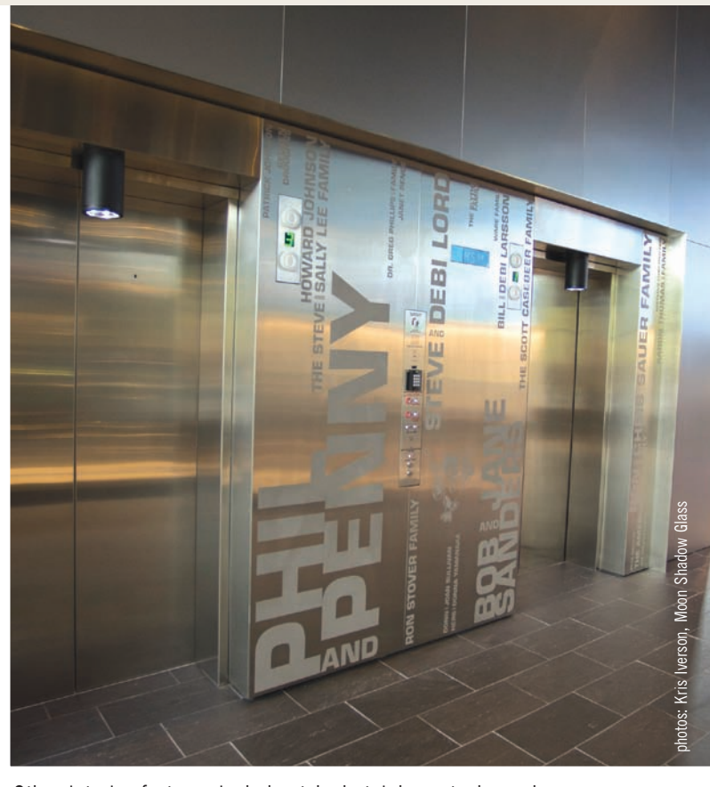
Other interior features include etched stainless steel panels.

November/December 2013 www.glassguides.com 13